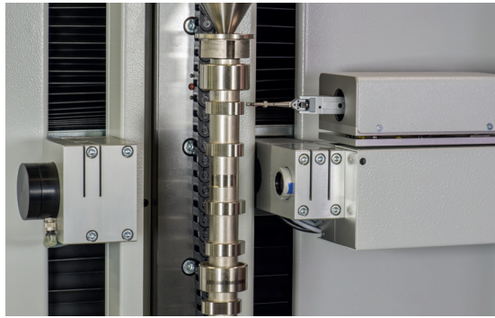
Tactile measuring unit with y-measuring axis 60 mm

The MarShaft SCOPE plus is a universal, fully automatic optical shaft measuring system for testing rotationally symmetrical workpieces.